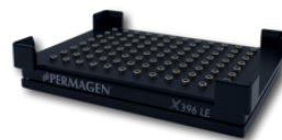
X396 Combo 384-well/96-Well Magnetic Plate SKU # A040523