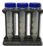
15 mL / 50 mL Centrifuge Tube Magnetic Separator SKU # MSR1550