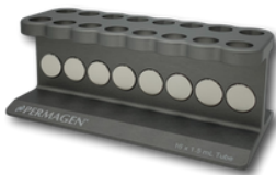
1.5 mL 16-tube Magnetic Separation Rack SKU # MSR16